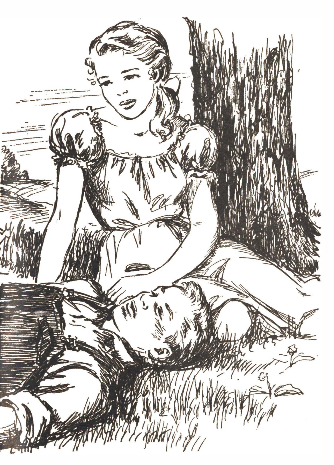
OCTOBER , 1947